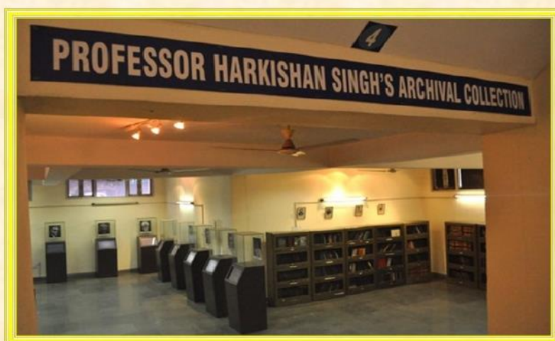
Showcasing the collections in the book shelves and bio-sketches of the Luminaries of Indian Pharmacy shelves and bio-sketches of the Luminaries of Indian Pharmacy