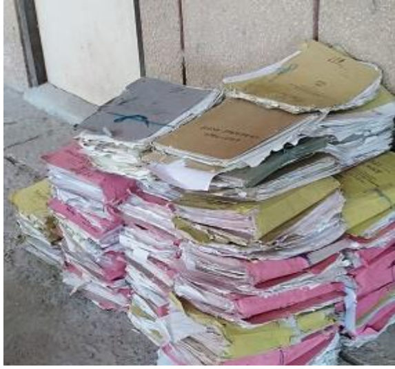
Library: Scrap items identified for disposal