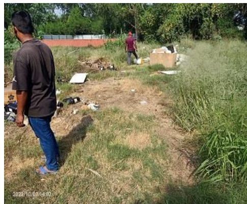
Central Instrumentation Laboratories: